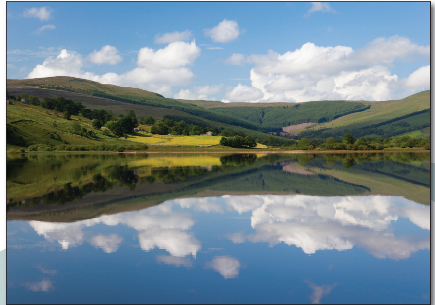
Reflections in Seme Water