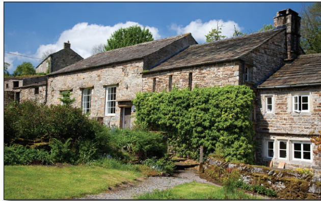
Countersett Meeting House