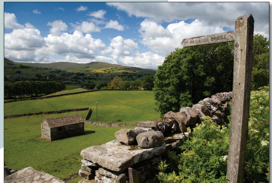
Path back to Haylands Bridge